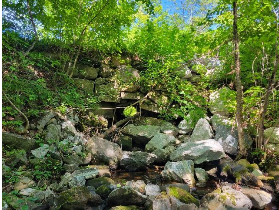
Downstream Russellville Road Culvert